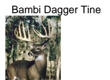
Bambi Dagger Tine